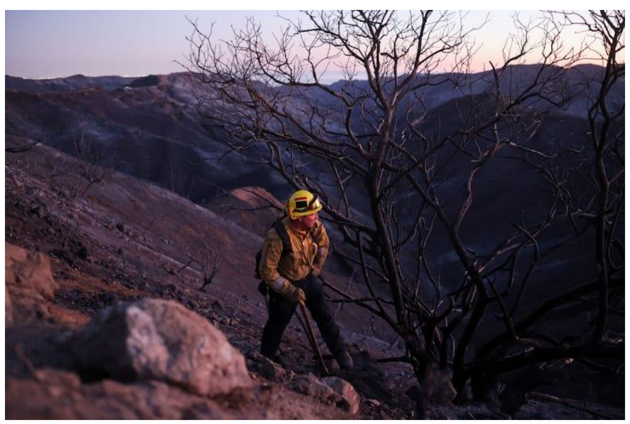
Easing conditions will help crews battle L.A. fires