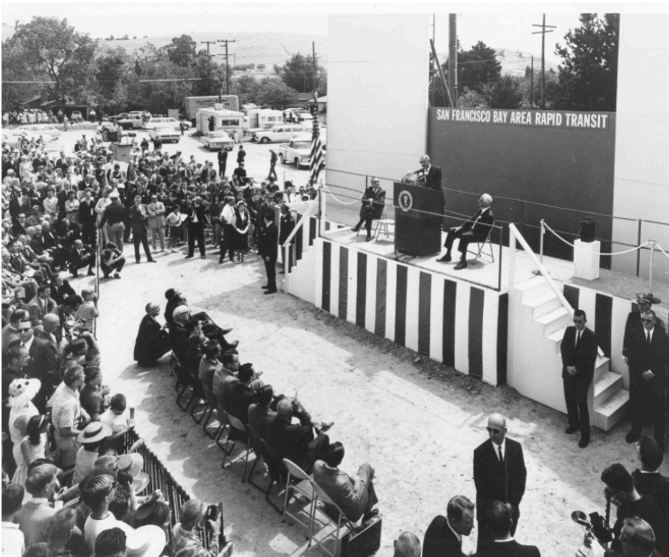
LBJ in Concord 1964 — BART ground-breaking